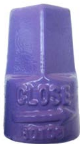
Recycled Water Use