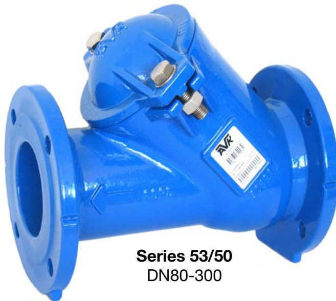
Series 53/50 DN80-300