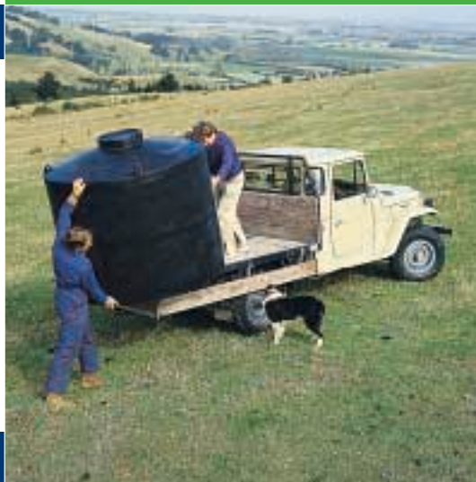
Lightweight for easy handling.