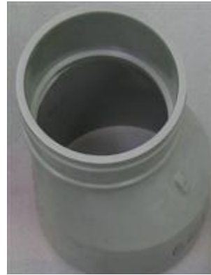
Product Description Guide

Humes distributes a range pressure pipe fittings to compliment our pressure pipe systems.