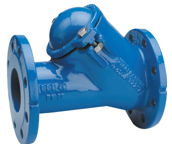
Series 53/35 DN 50 & 65

AVK Australia's website contains the latest product information and data sheets.