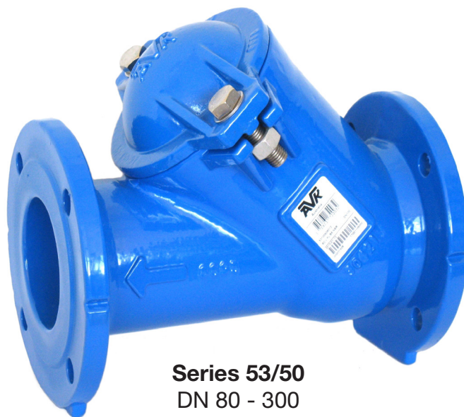
Series 53/50 DN 80 - 300

Note: Flange holes for DN 50 & 65 are drilled and tapped